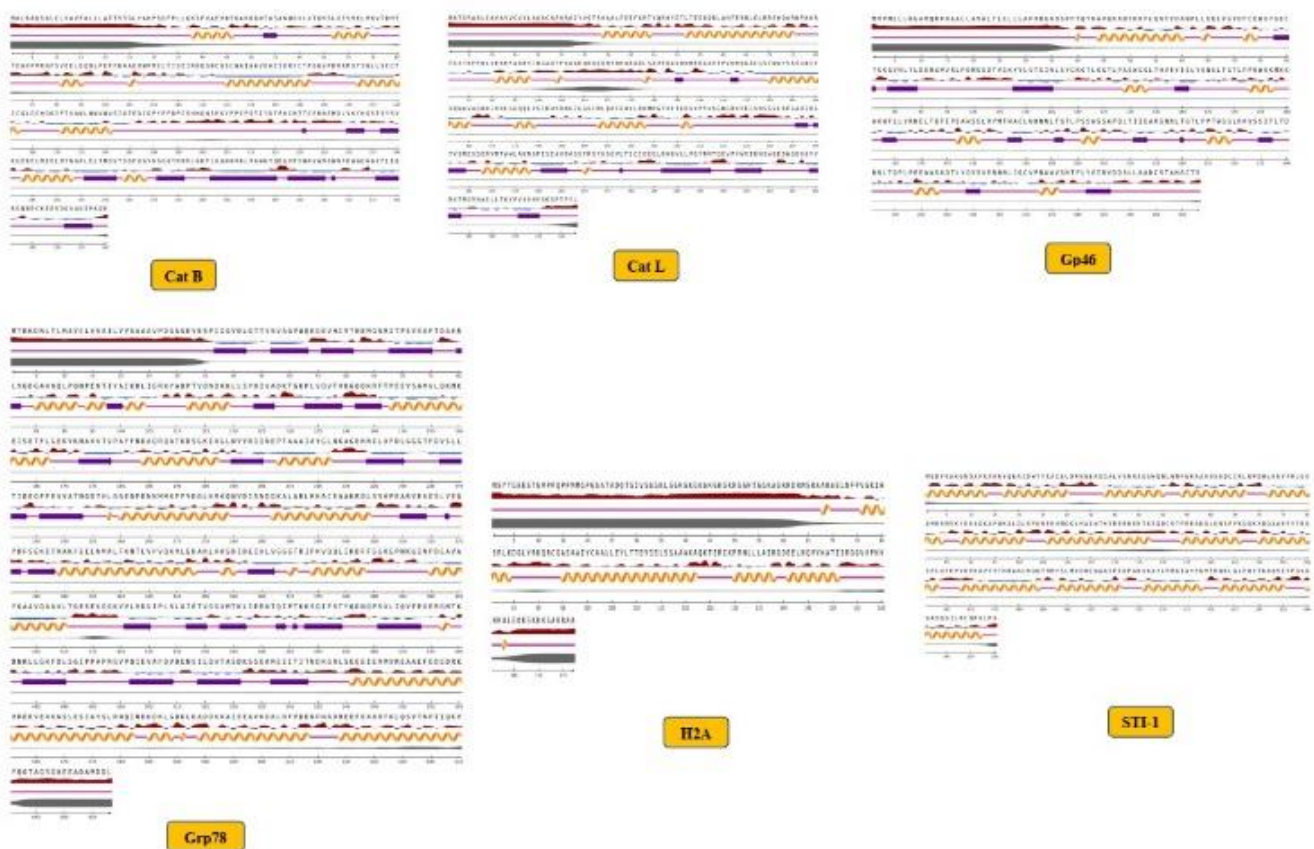
Fig. 2. Secondary structure prediction for 6 selected L. major vaccine candidate antigens (CatL, CatB, grp78, gp46, H2A and STI-1) using NetSurfP web server.

Based on the results from the NetSurfP secondary structure analysis tool coils were the predominant secondary structure, constituent in 4 proteins (CatL, CatB, gp46, and H2A), whereas helices were frequently found in the STI-1 protein. Furthermore, a significant proportion of the grp78 protein secondary structure was formed by extended strands and helices. In addition, H2A possessed a significant proportion of disordered residues, while disordered regions were only found at the N-termini of CatL, CatB, and gp46 as well as the N-terminus and C-terminus of grp78. More details of the secondary structure prediction are provided in Fig. 2. Based on the I-TASSER predictions, those models with C-scores of -0.34 (CatB), -0.68 (CatL), 0.47 (gp46), -0.05 (grp78), -2.47 (H2A), and 0.13 (STI-1) were finally selected (Fig. 3).