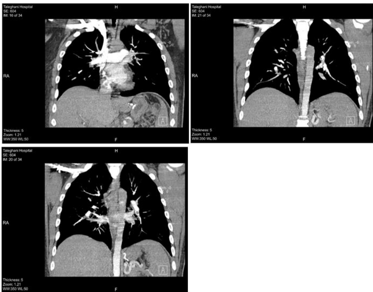
Fig. 1. Filling defect is seen in the left pulmonary branch extending to the lower lobar branch and also in the right lower lobar branch extending to the sub-segmental branches.

Moreover, urine analysis showed slight hemoglobinuria. Second day Heparin was prescribed due to elevation in active Partial Thromboplastin Time (aPTT) and the patient started taking Rivaroxaban (15mg twice per day) and two units of Fresh Frozen Plasma (FFP) was ordered for him. Blood test