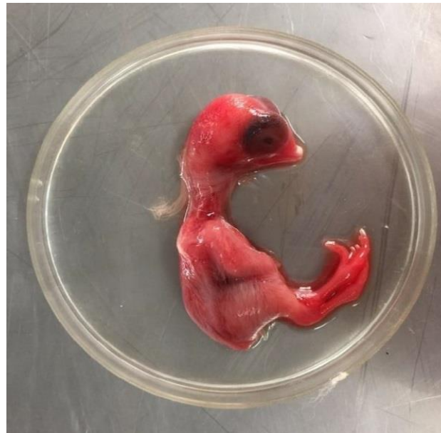
Fig. 1. Replication of IBDV in embryonated eggs caused severe hemorrhage and insufficient embryo development signs.

Similar to the ELISA result, the NI was significantly higher ( P < 0.05 ) in chickens immunized with inactivated IBDV with chitosan at 0.5 and 1% concentrations, compared to the other chicken groups (Fig. 3).