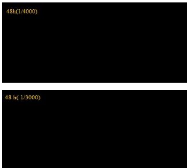
Fig. 2. Complete loss of infectivity of the virus treated with 1:3000 and 1:4000 of BPL was evident at the end of a 48 h incubation period.

When the lowest concentration of BPL (i.e. 1/5000) was used in present study, no significant reduction was observed at the end of 48 h in the infectivity titer ( 5 \times 10^5 FFU/ml). At concentration of 1:3000, the infectivity titer (infection in cell culture) dropped from 6 \times 10^6 FFU/ml to 3 \times 10^2 FFU/ml at the end of the 24 h period which became zero at the end of 48 h period at 4°C.