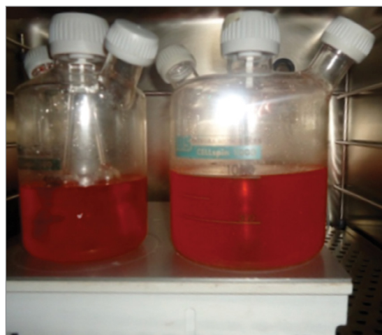
Fig. 1. MDCK-SIAT1 cell growth on Cytodex-1 microcarriers in spinner-flask cultivation

Seeding the spinner flask. The prepared microcarrier beads were dispensed (2 g/l) to a siliconized spinner flask (Cell Spin, Integra Biosciences, Germany). MDCK-SIAT1 cells (2 \times 10 5 /ml) were added to the flask then complete medium was added to approximately half of the final volume. The flask was placed on a stir plate in an incubator (37°C, 5% CO 2 ), agitated with a 1 min on and 20 min off cycle for 4 h at 55 rpm. After 4 h, a half-ml sample was removed and viewed under a microscope to confirm the cells attachment. Subsequently, complete medium was added up to 70% of the full volume of the flask. Finally, the flask was placed on the stir plate in the incubator as above at 50 rpm as shown in Fig. 1 [18- 20].